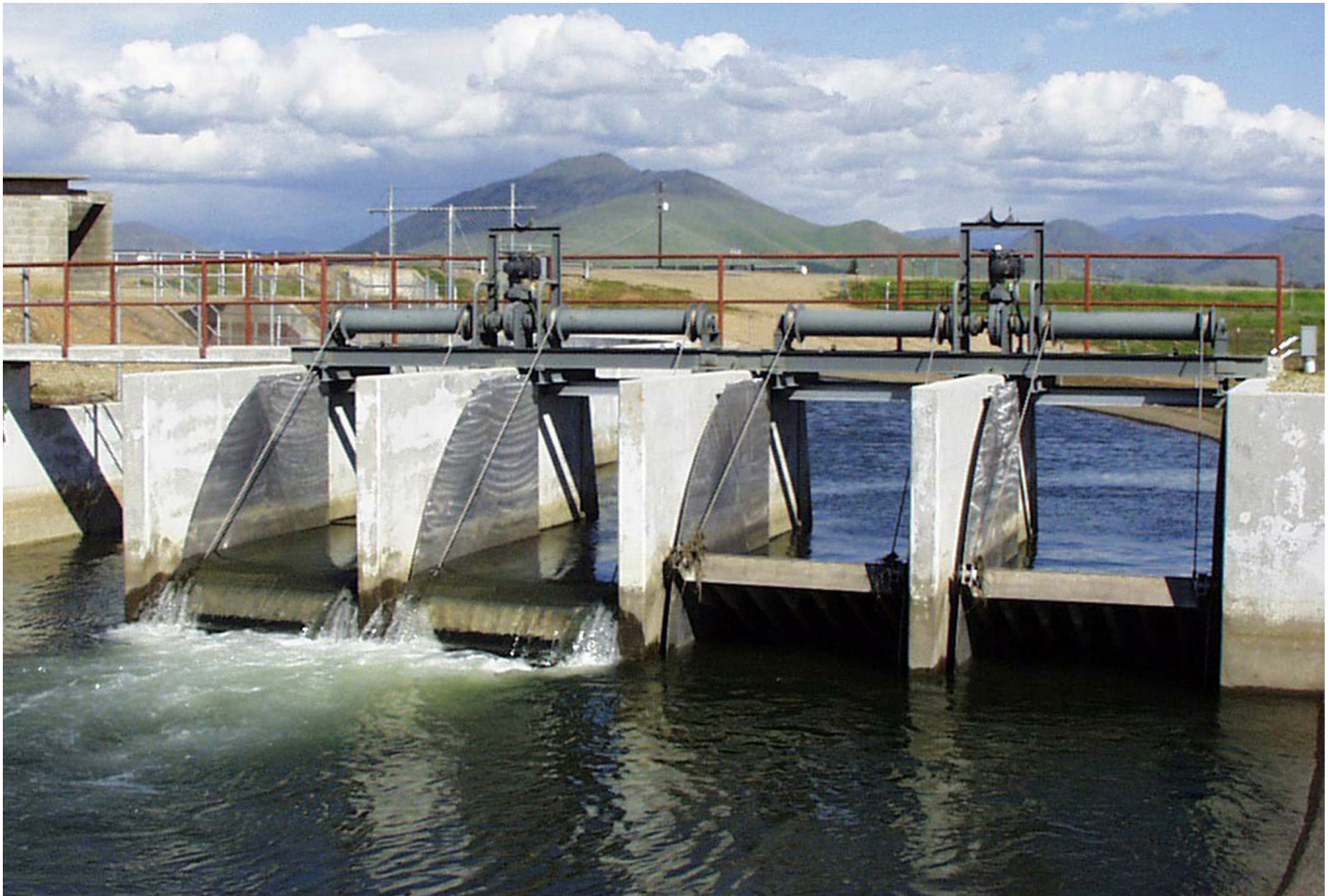
Safe, Effective Canal Control